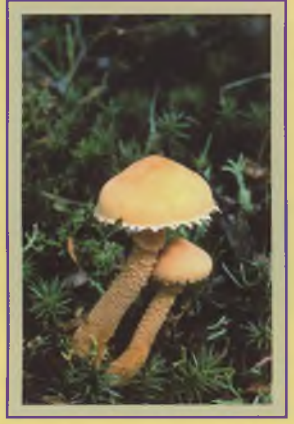
Cystoderma amianthinum: Fruit bodies grow amongst moss in shady places and forest margins.

Fungi come in an amazing diversity of form and colour. Here are just a few of the spectacular species that occur within the Warrandyte State Park.