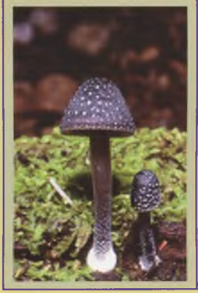
Mycena nargan: Usually growing in open clusters but sometimes clumped on dead wood.